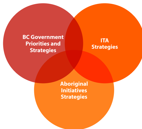
Figure 1: Aboriginal Initiatives Strategic Drivers

Within this strategic framework, this Aboriginal Initiatives Skills Training Plan 2015-18 focuses on the activities listed in Figure 2 , and are built on input and direction from a variety of stakeholders who set the broader context for the activities. These six activities are presented under two headings - 1) Relationships, and 2) Services - and total six activity groupings.